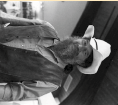
Dr. Robert T. Bakker - Key Note Speaker

Burpee Museum of Natural History - Inspiring all people to engage in a lifetime of learning about the natural world.